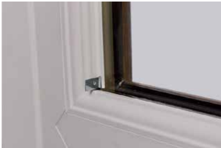
10. Slide bottom slot of profile over the bottom bracket. Repeat both sides.