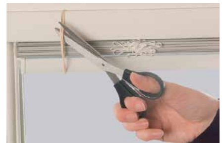
16. Snip off the rubber bands and carefully lower the slats to the bottom frame.