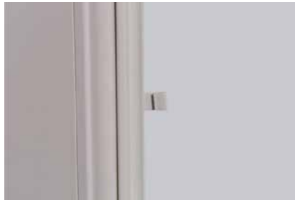
11. At the appropriate position(s) on each side profile, fit retention clips (long side profiles only).