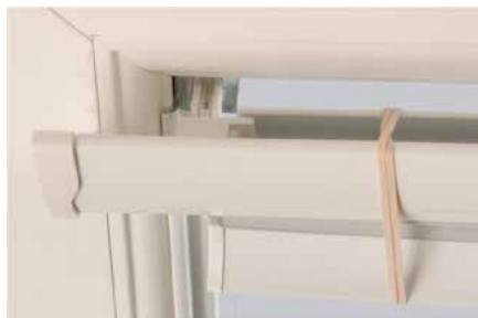
14. With rubber bands in place, align the headrail end cap slot with bracket arms.