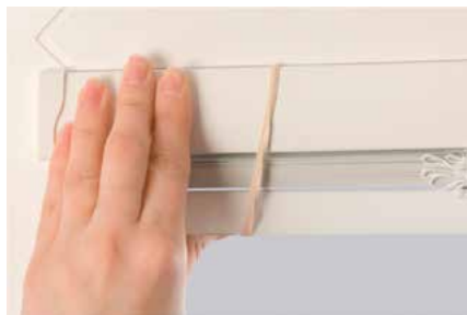
15. Ensure headrail is correctly aligned and firmly press home.