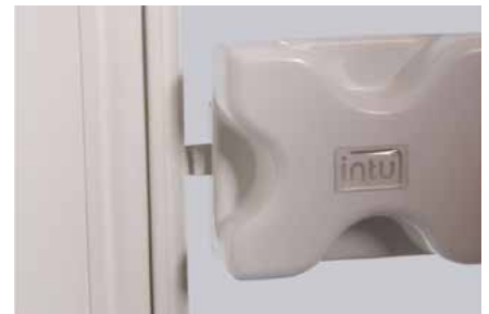
12. Press home using the insertion tool. Fully located the clip will sit over the side profile.